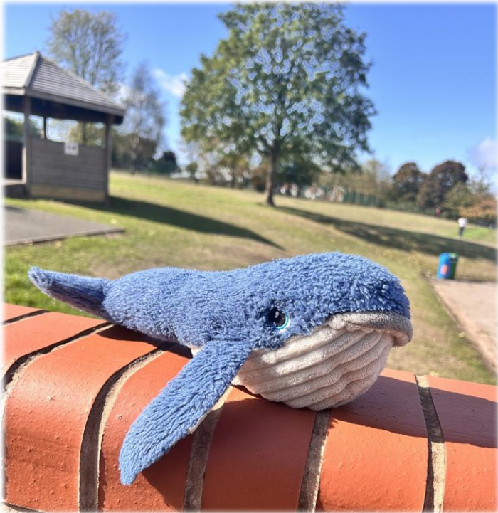
Adventures with Walter